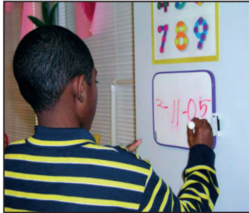
Student moves from his seat to write the date on the board

Group experiences often expect students to do much sitting, listening and remaining quiet. Our groups are most effective if the students can more actively participate. The children need to be able to move about and manipulate objects as a routine part of their group participation.