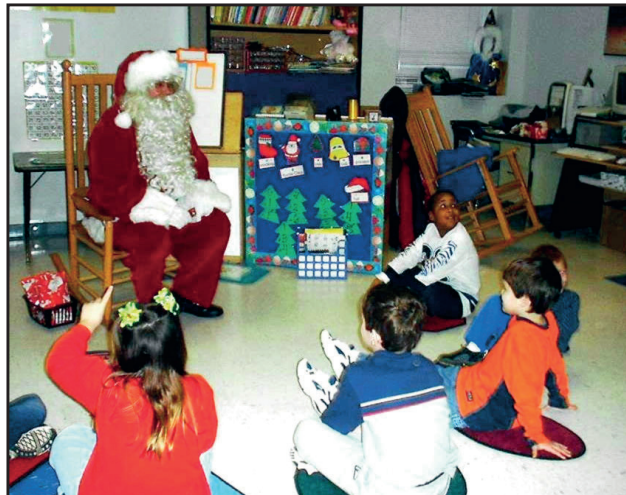
Santa is a surprise visitor during circle time, but students remember their well-learned routines

In these ways, we implement procedures that become routines because they are used each day in similar situations. Procedures do not mean that the same activity must be done each day or that the order of the activities must be the same, but the procedures do mean the activities follow certain forms. The child's uncertainty about the novel event is eased because the procedures are well known. Family members, too, can participate in circle group activities because students have learned the procedures well. As a result they are less anxious about why there is an unexpected person at group.