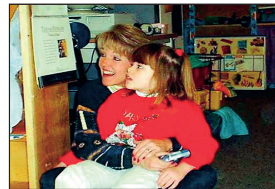
Mother and daughter at circle time