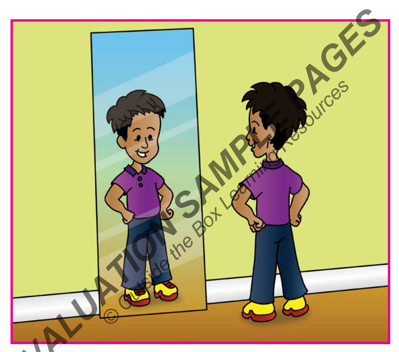
I get dressed for the party. I look nice!