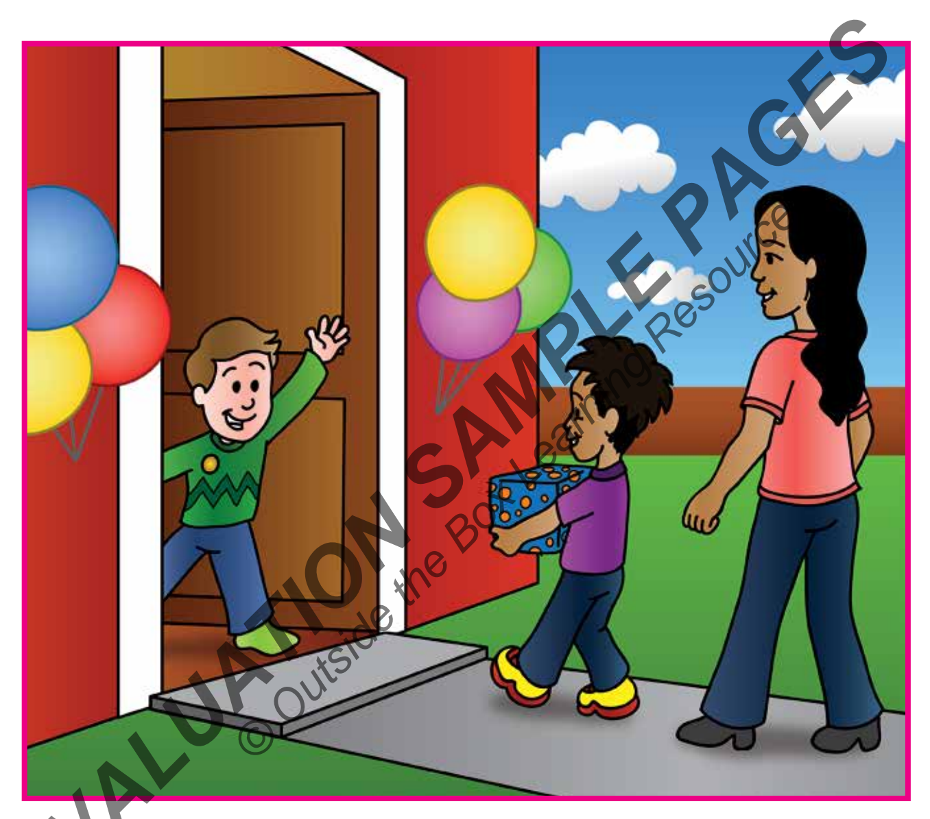
Here we are at the party.