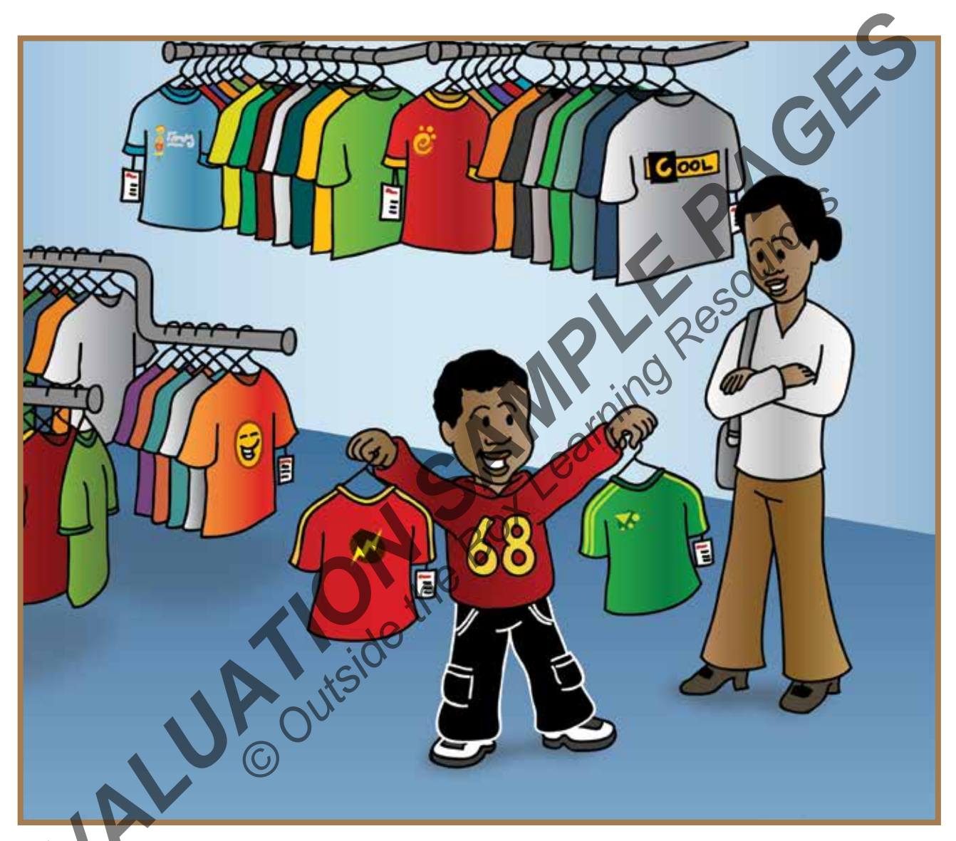
like the red T-shirt and the green T-shirt.