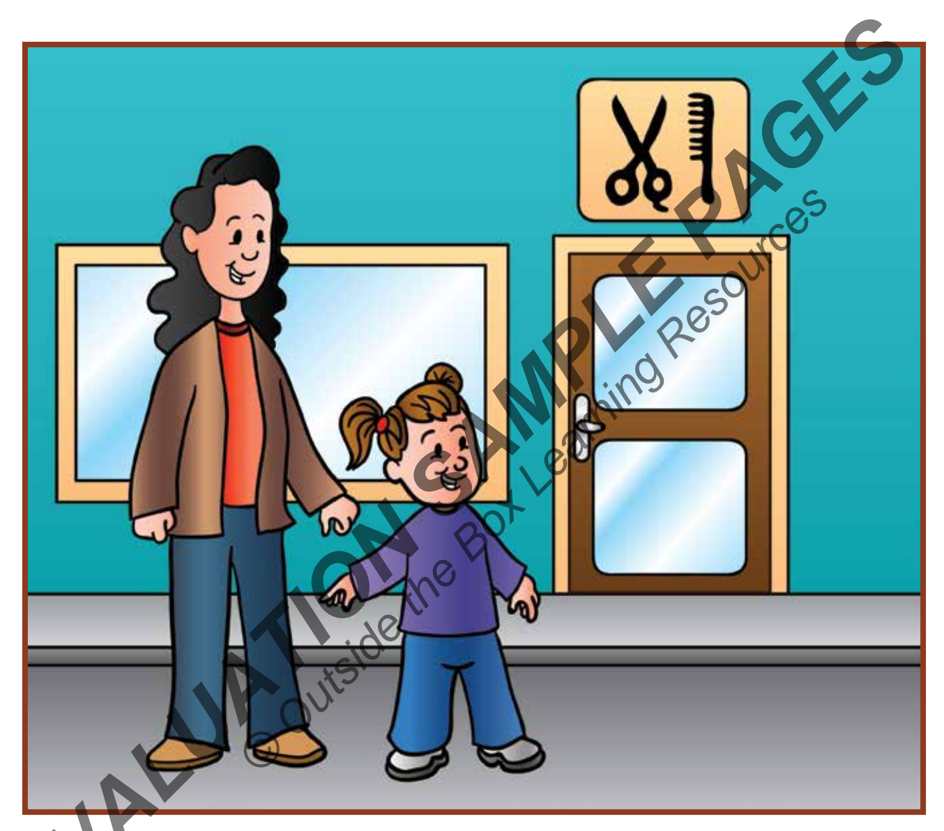
I am going to the hairdresser.