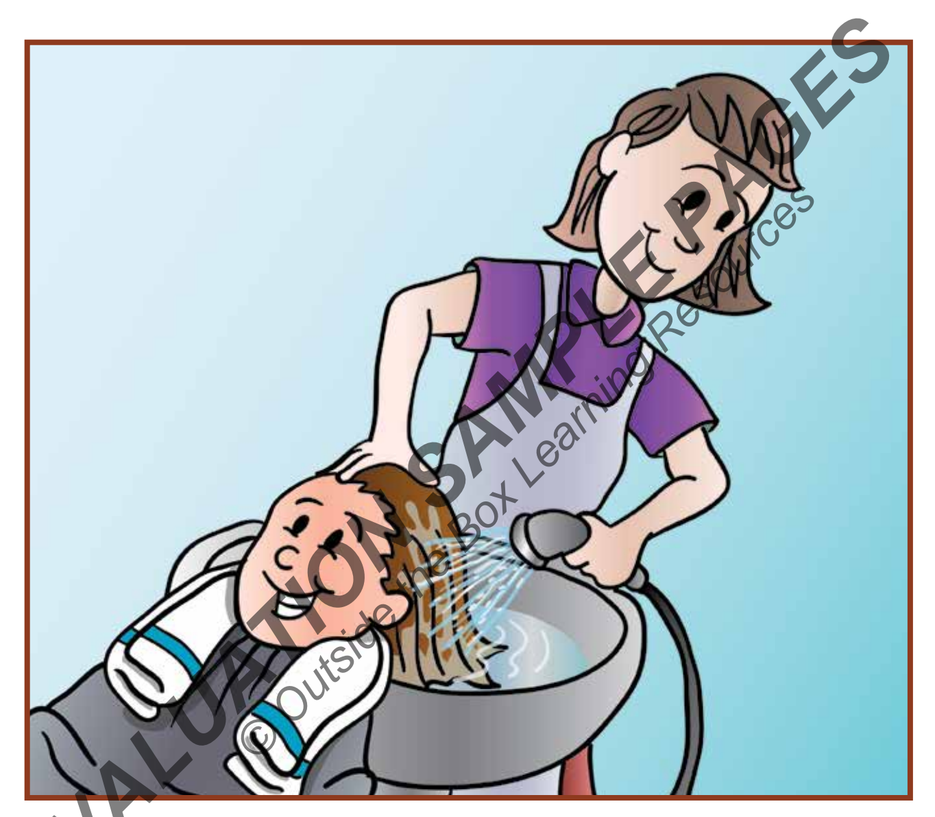
The hairdresser puts a cape and towel around me. Hean back and the hairdresser washes my hair.