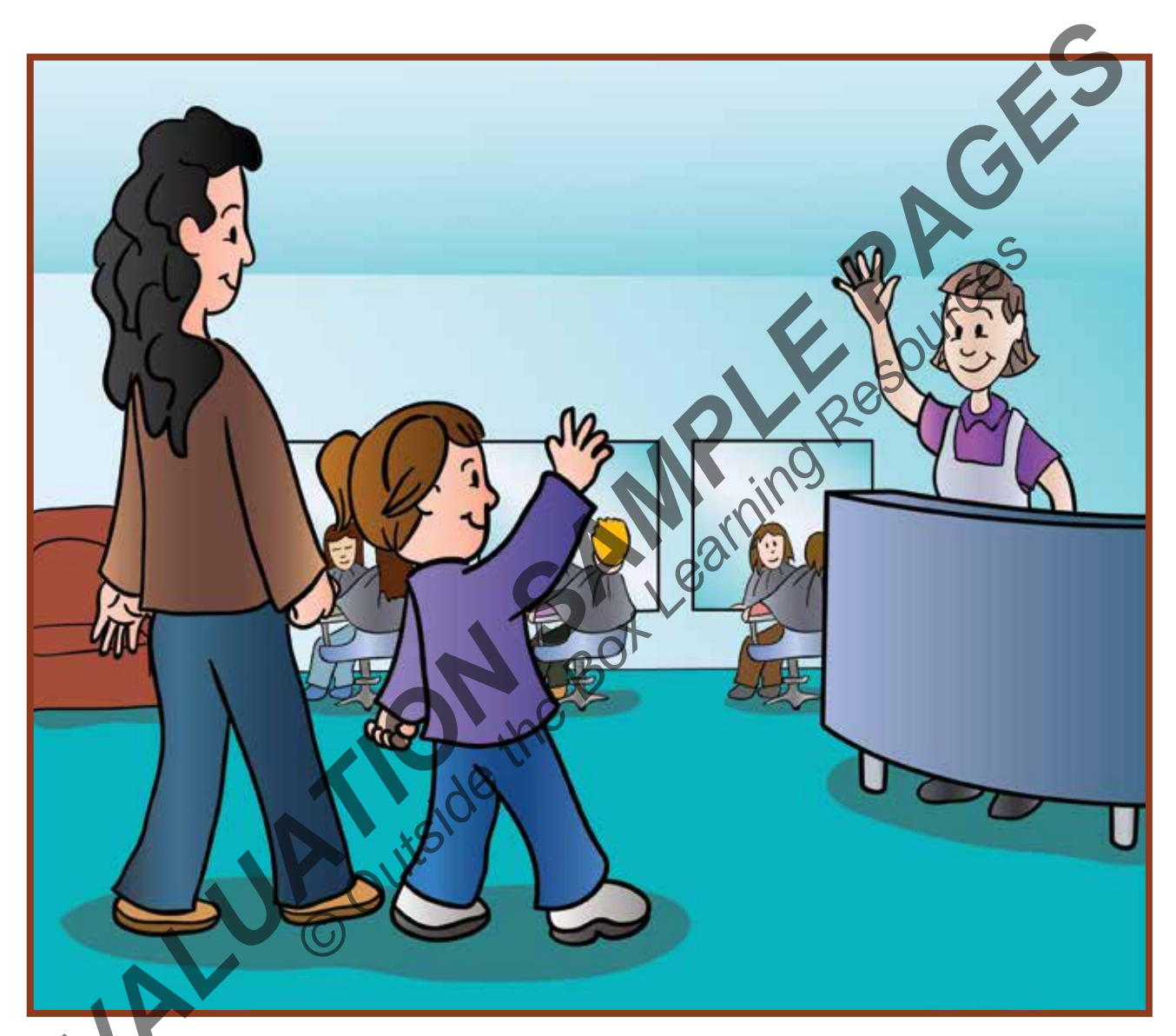
"Hello!" I tell the lady "I'm here."