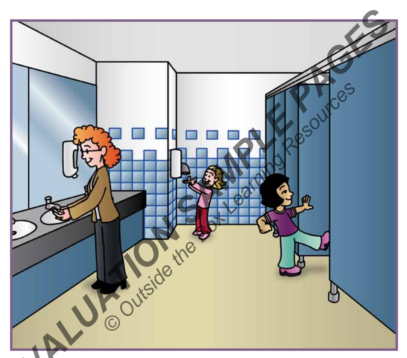
We go to the bathroom.