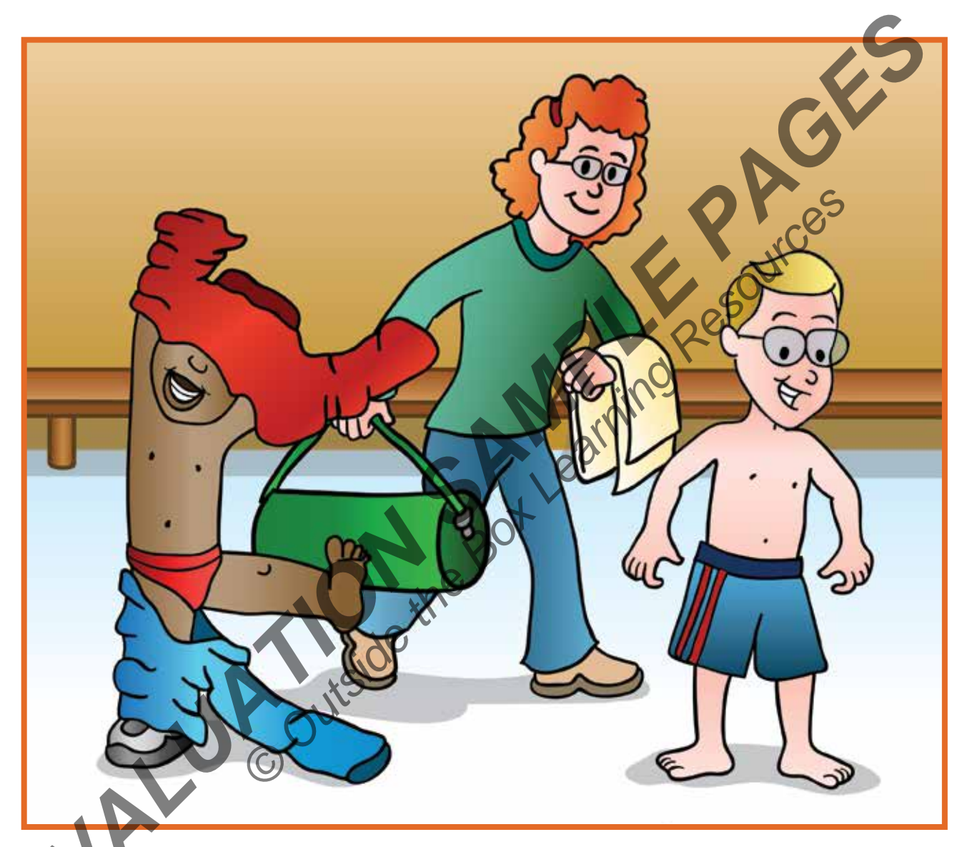
I get undressed. I put on my swim suit.