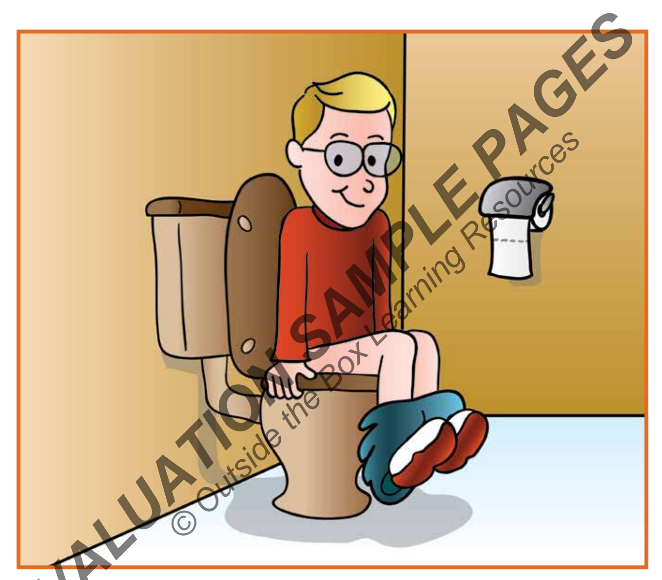
I go to the bathroom.